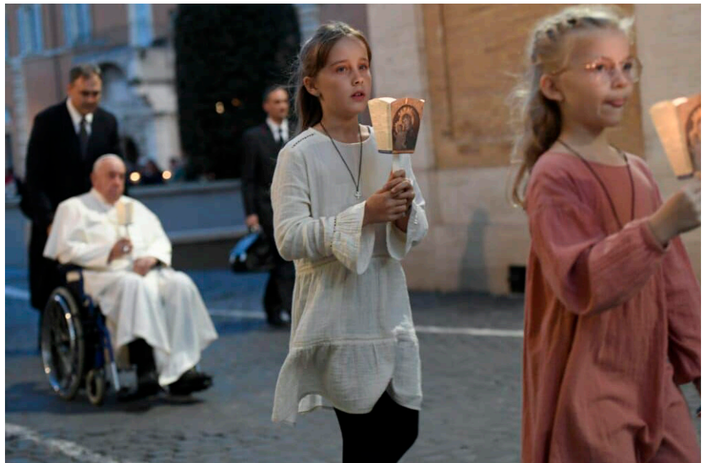
Pope Francis, led by candlebearers, at the Ecumenical Prayer Vigil in Protomartyrs Square.

Stating that “the journey of synodality is, and must be, ecumenical”, Pope Francis further expressed his hope that the ongoing Synod would